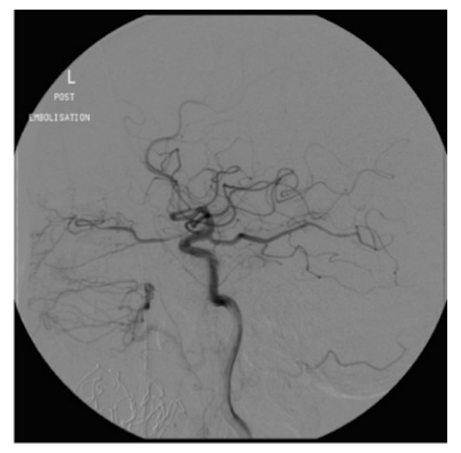
Figure 3 Post-embolization angiogram showing absent communication of carotid artery and cavernous sinus (ie, carotid-cavernous fistula closed).