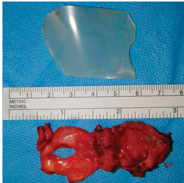
Figure 1 Excised fibrous cyst and silicone sheet removed from an area of orbital roof repair performed 23 years before (Patient 11; Table 1).

Twenty-three patients (13 male; 57%) presented at a median age of 46 years (mean 45.3; range 14–76 years), with the interval between previous surgery and presentation ranging from 1 to 50 years (median 25 years). Five had undergone ocular removal (with ball implantation in 4), six had orbital fracture repair with a silicone or titanium implant, eight had a history of prior strabismus surgery, three had retinal detachment repair (either a scleral buckle or vitrectomy) and a single patient had required repair of a conjunctival laceration during childhood. All except one patient underwent either marsupialisation or complete excision of the implantation cyst, with no record of recurrence at up to 56 months follow-up (mean 14, median 24, range 3–56 months). All cysts had a fibrotic wall of variable thickness, with most showing mucin-secreting conjunctival epithelium or, more rarely, pseudostratified