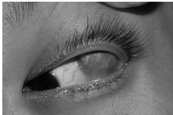
Figure 2 Patient presenting with a large orbital conjunctival inclusion cyst overlying the lateral rectus insertion at 25 years after strabismus surgery (Patient 12; Table 1).

ciliated respiratory epithelium (Table 1). The visual acuity changed in a half (11/22) of the patients undergoing surgery, this always being an improvement (Figure 3).